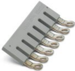
Insertion bridge, pitch: 9 mm, number of positions: 7, color: gray

Please be informed that the data shown in this PDF Document is generated from our Online Catalog. Please find the complete data in the user's documentation. Our General Terms of Use for Downloads are valid ( http://phoenixcontact.com/download )